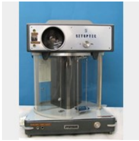
balance, Siotptic (?)