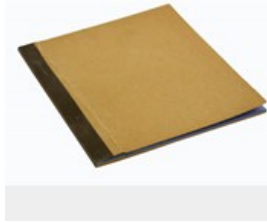
delinquent account notification