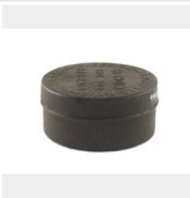
Gin Pills for the Kidneys