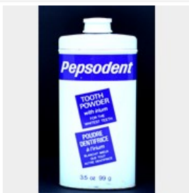
Pepsodent tooth powder