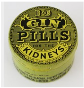
Gin Pills for the Kidneys