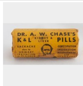
Dr. A. W. Chase's Kidney and Liver Pills