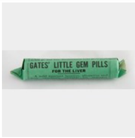
Gates' Little Gem Pills