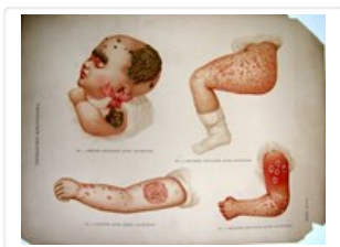
Plate XXXIX, Vaccination Eruptions [medical illustration]

https://mhc.andornot.com/en/permalink/artifact11151