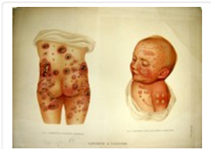
Plate XLI, Gangrene Vaccinide [medical illustration]

https://mhc.andornot.com/en/permalink/artifact11552